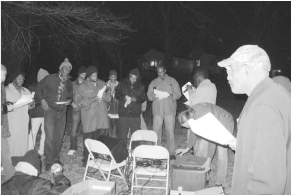
Clifton men sing to Lake Claire

best thing about being our neighbors in Lake Claire is when they give back to the community. Throughout the year, the men participate in activities in Lake Claire and in nearby Candler