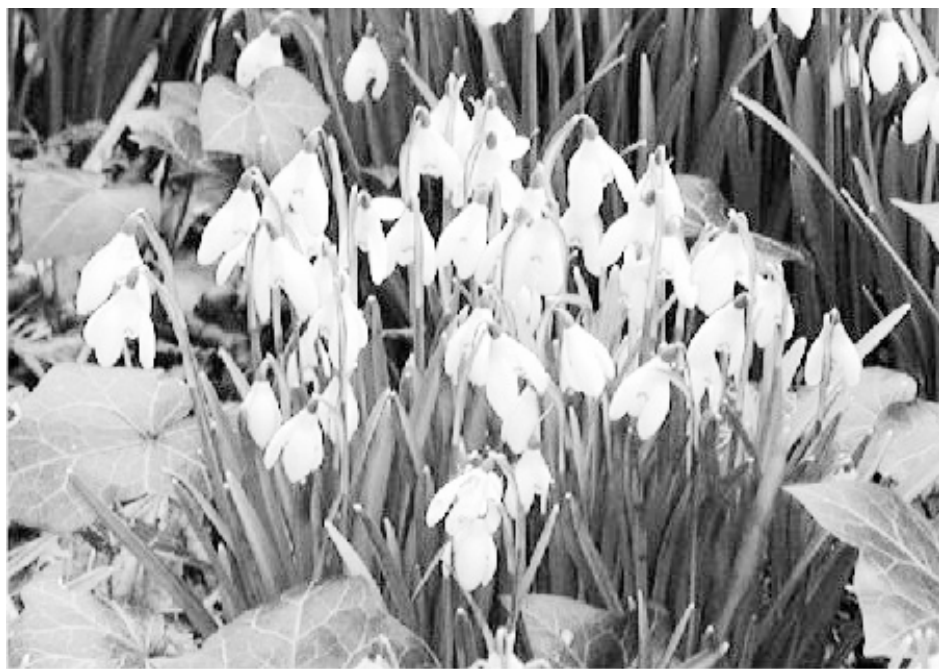
Snowdrops (Galanthus nivalis)

Leah Pine is a landscape architect and certified arborist specializing in sustainable design. See www.leahpine.com .