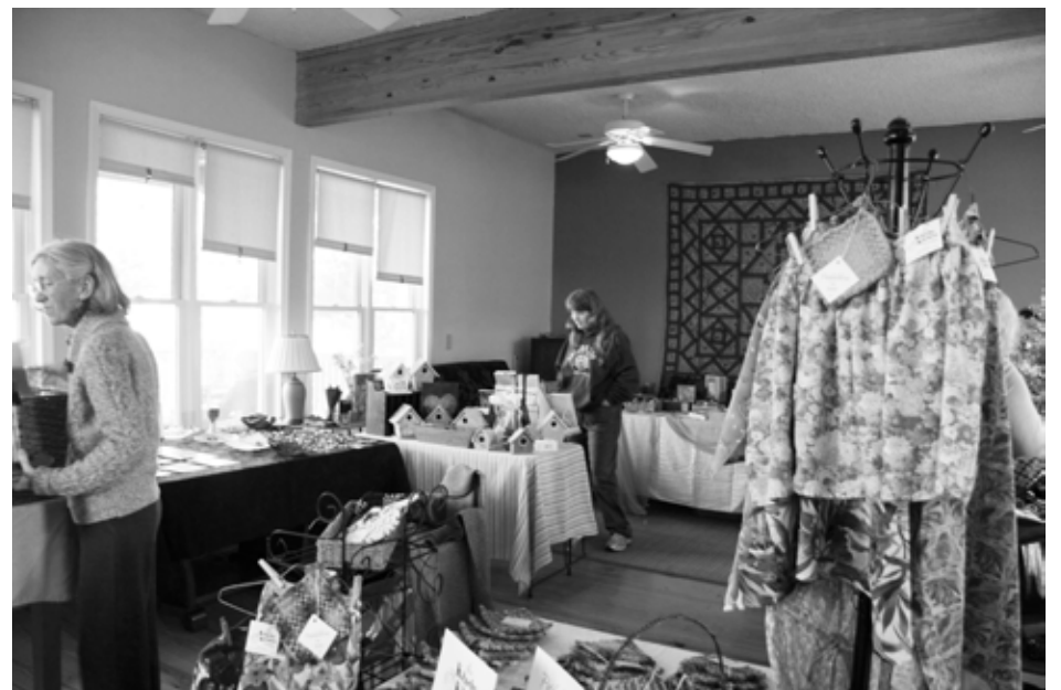
The Craft Sale

Homes Are Selling! Why Not Yours? Let's Get Your Home Sold!