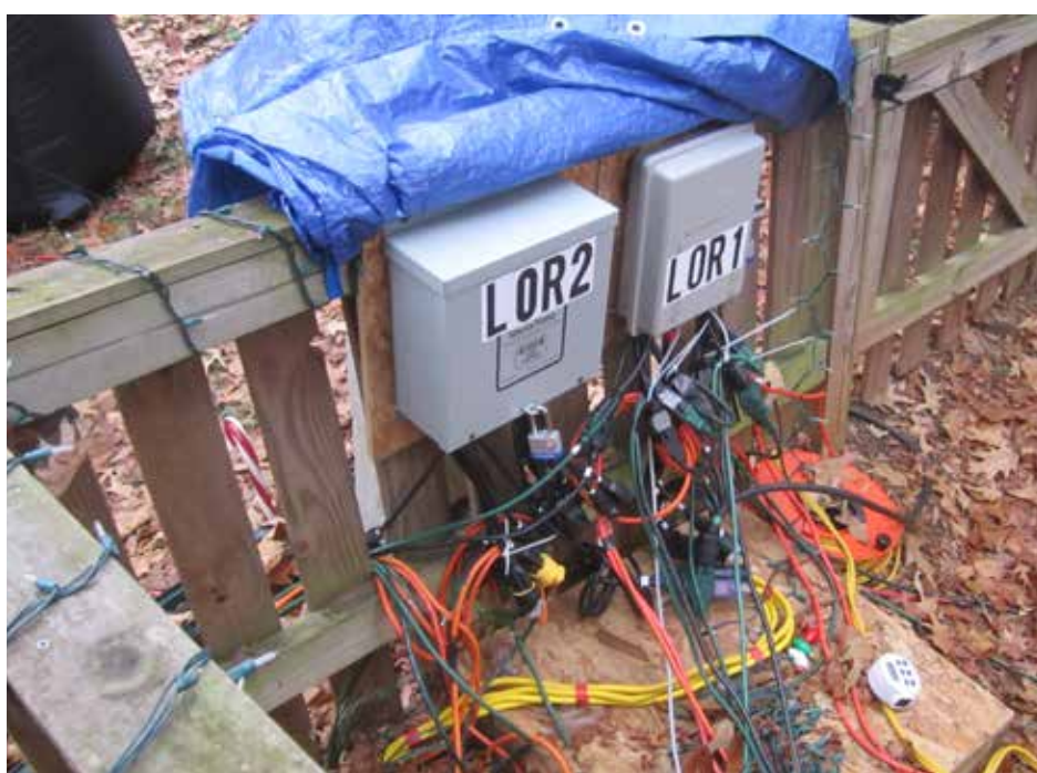
Myles Nielsen's Complicated Light Setup

programming in October and have my light show live shortly after Thanksgiving. Once the programming is done, I have to test all of the strands in my room and replace broken lights. Then I organize the light strands by