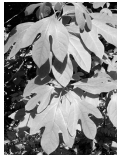
Native Sassafras albidum

If you ever wondered what the thicket of shrubs/trees along DeKalb Avenue is -- it's sassafras. The Georgia Native Plant Society just named it Plant of the Year for 2013. Sassafras ( Sassafras albidum ) has fascinating medicinal and historical uses, as well as wildlife and aesthetic value. It is a delightful small to medium-sized tree that is underused in home landscapes. It offers great benefits to native wildlife as well as to the humans that either have or plant this wonderful native tree in their yards. See complete information on this at http://www.gnps.org/indexes/Plant_of_the_Year.php . Enjoy!