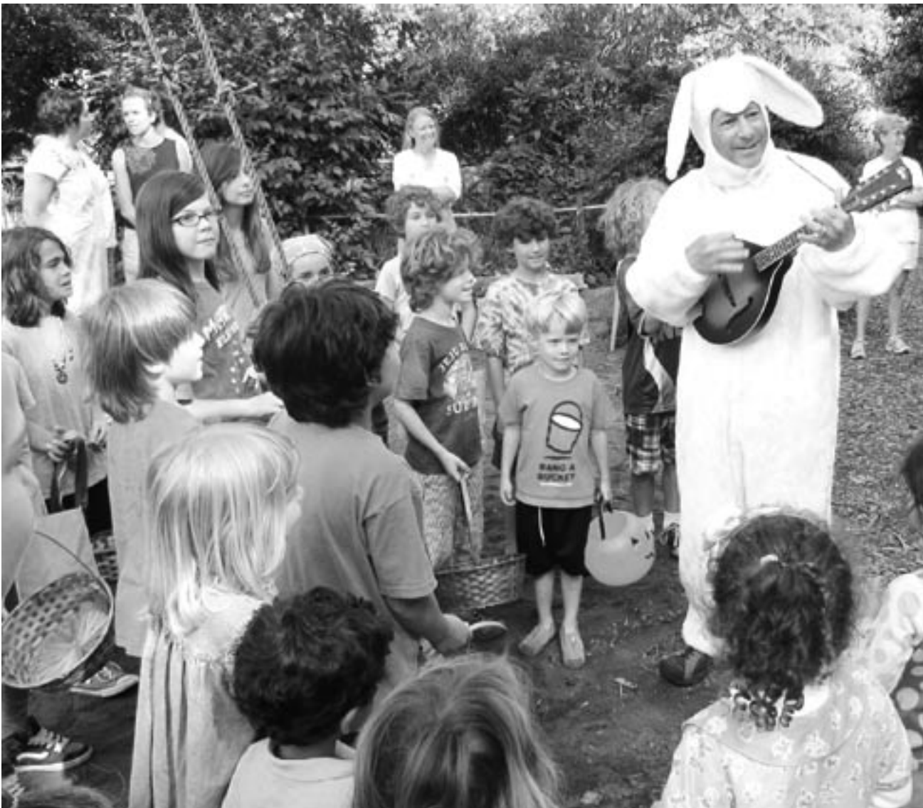
And presenting our very own Ruby... the Rabbit.