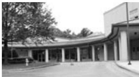
The welcoming entrance for students at Mary Lin Elementary.

Are we getting redistricted? What's the deal with APS? I don't have kids so schools don't matter to me. You may have heard some of these phrases. To be honest, I've heard them since I moved into Lake Claire almost 8 years ago. This time things are a bit different.