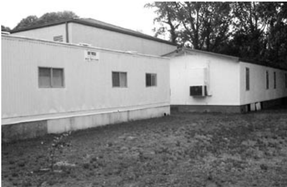
View of the several, aging portable classrooms (aka trailers) installed behind Mary Lin Elementary School.

A few calls or emails can make a difference!