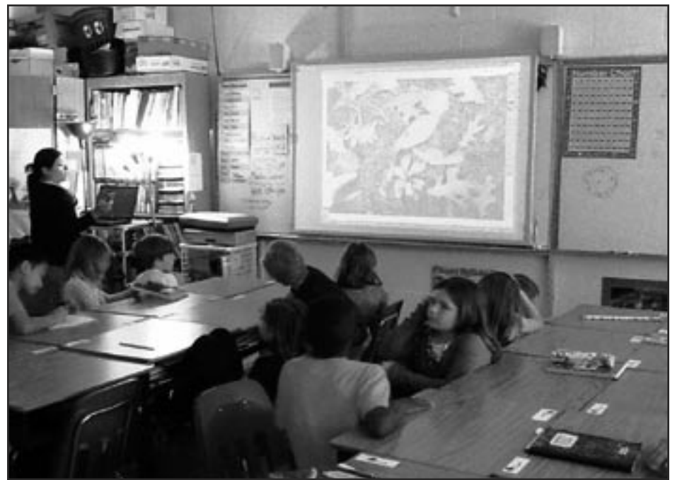
Mary Lin Foundation supports this classroom environment.

Mary Lin Elementary is YOUR neighborhood school and we need your support. Help us continue to provide the best instructional and technological opportunities