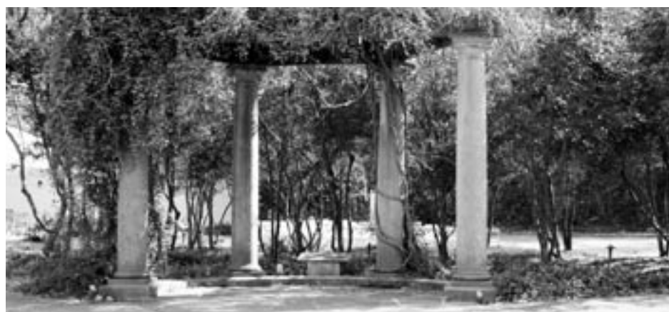
Cator Woolford Gardens