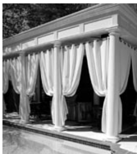
Decatur Blooming Publicity Photo.