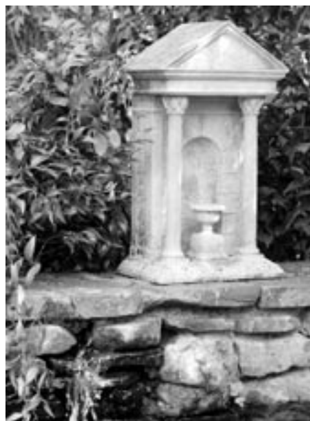
Decatur Garden Tour Publicity Photo.

Your ticket purchase benefits the Oakhurst Community Garden Project and the Decatur Preservation Alliance, to support their operations and programs. To find out more about the tour and to preview some of the gardens selected, follow us on Facebook at "Decatur Garden Tour." More information can also be found on our website, www.decaturgardentour.com .