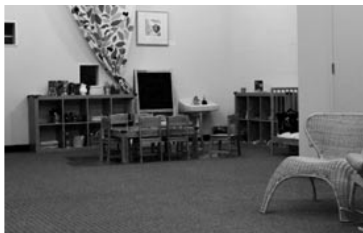
Play space at Bean Work Play Cafe

With Bean's opening, parents have access to a flexible work space, classes, workshops, networking opportunities and a vital community of smart and creative parents. Children, ages 12 months-7th birthday, will enjoy a program that inspires learning and offers play dates on demand. Membership options are available offering discounted childcare rates, class fees and a variety of other benefits. For more information please visit beanworkplaycafe.com or call (404) 828-0810.