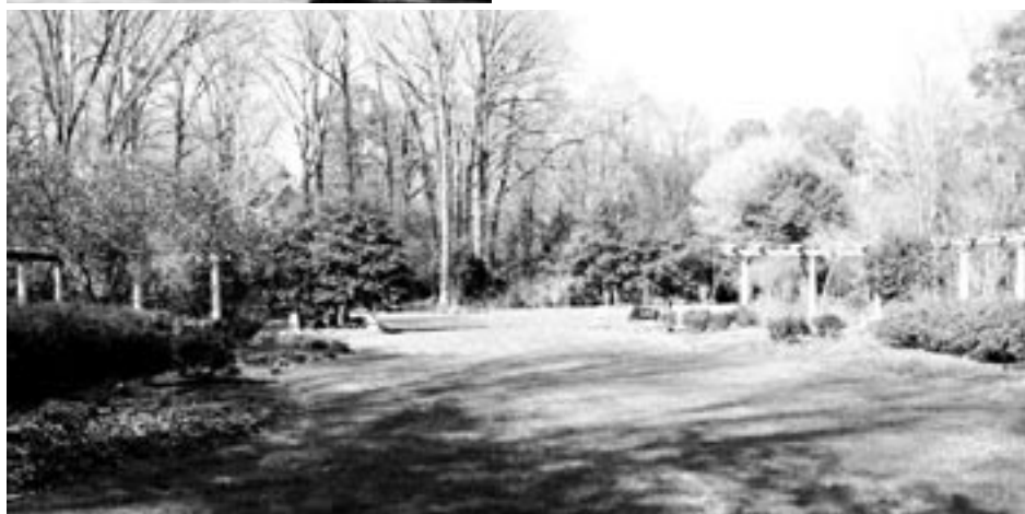
Cator Woolford Gardens