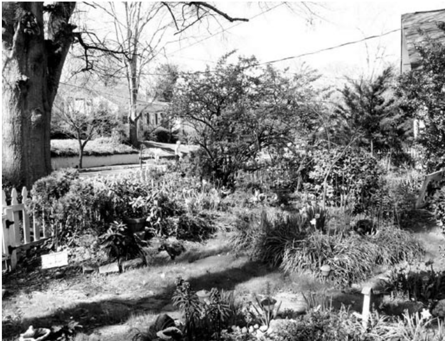
Beth Damon's garden

In developing an interesting and fun small yard garden, it is not necessary to use a large quantity of different plants. Stepping stones can be picturesque and detract less from the size of the yard than wider walks. The plants one uses obviously depend on the sun; once the old oak pictured in the front