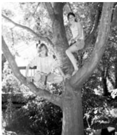
Last year's festival at the Land Trust

Land Trust Dirt Fest 2011 April 23 & Easter Egg Hunt April 24