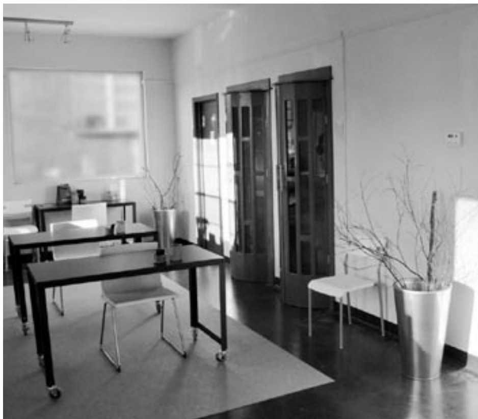
Work space at Bean Work Play Cafe

Bean Work Play Café opened March 12, 2011 in the East Decatur Station complex.