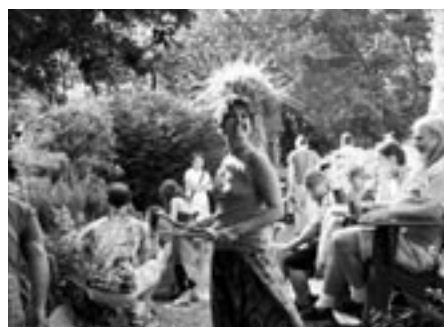
Last year's festival at the Land Trust