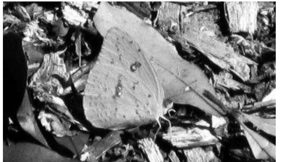
Cloudless Sulphur butterfly

The Cloudless Sulphur enjoys getting nectar from long-tubed