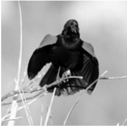
Red-winged Blackbird

Here, finally, is the Freedom Park Bird and Butterfly Garden Update. The Freedom Park Bird and Butterfly Garden was started as a joint project of the Atlanta Audubon Society and the DeKalb Master Gardener Association. Our first plant was put in the ground in the spring of 2005, and we've been planting every year ever since. The purpose of the garden is to inspire the use of native plants to attract birds and butterflies (and bugs). It's located at the corner of North Avenue and Candler Park Drive. To find out more about the garden go to http://freedomparkgardenbirdandbutterfly.blogspot.com .