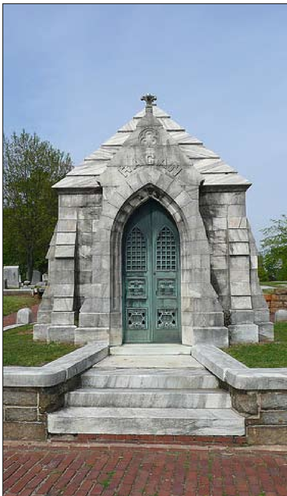
Mausoleum in Oakland Cemetery

For more information about this and other services of the City of Atlanta, visit www.atlantaga.gov . For guidance on getting a variance or on rezoning, visit the Variances & Rezoning page of the Lake Claire Neighbors website at http://www.lakeclaire.org/plan/zoning.htm .