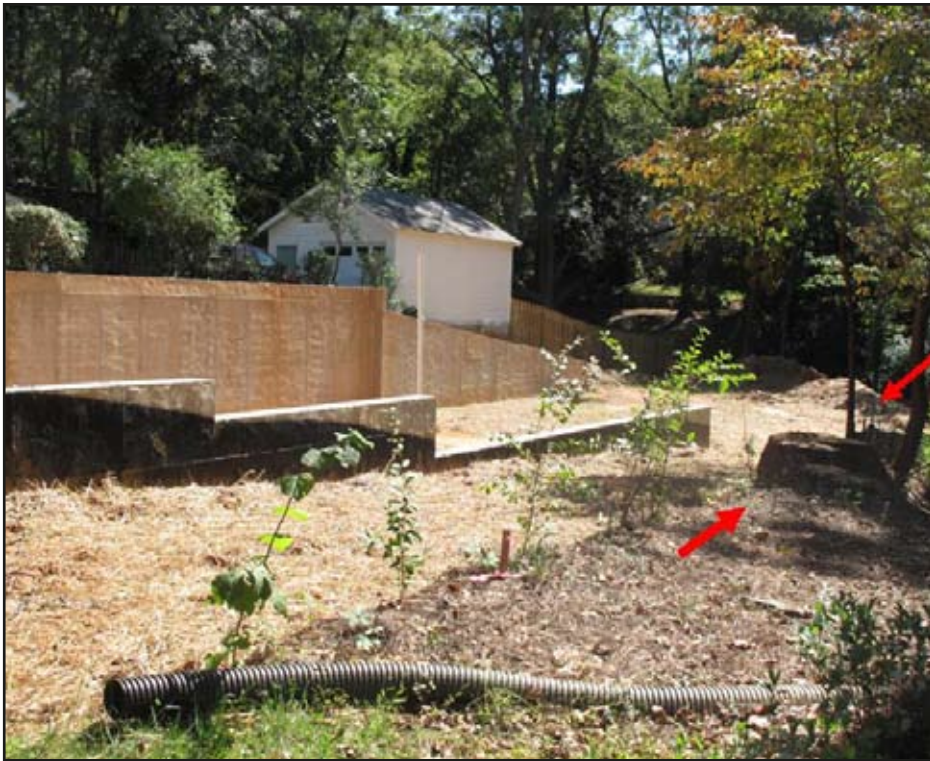
Arrows point to the stump of the larger tree.