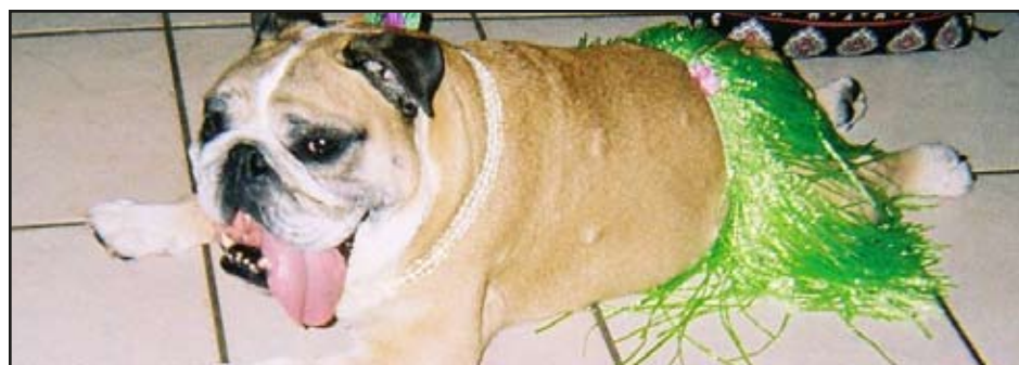
Aloha to Wendell, May 5, 1999—September 4, 2009.

We lost our little best friend today. His health issues that surfaced recently proved to be too much, and we had to let him go. He was so much fun. He went on many vacations with us. He got to swim in two oceans and the Gulf of Mexico, and he brought joy and a smile to hundreds of people. He was a lucky little bulldog. We'll miss you, little fella. Be good.