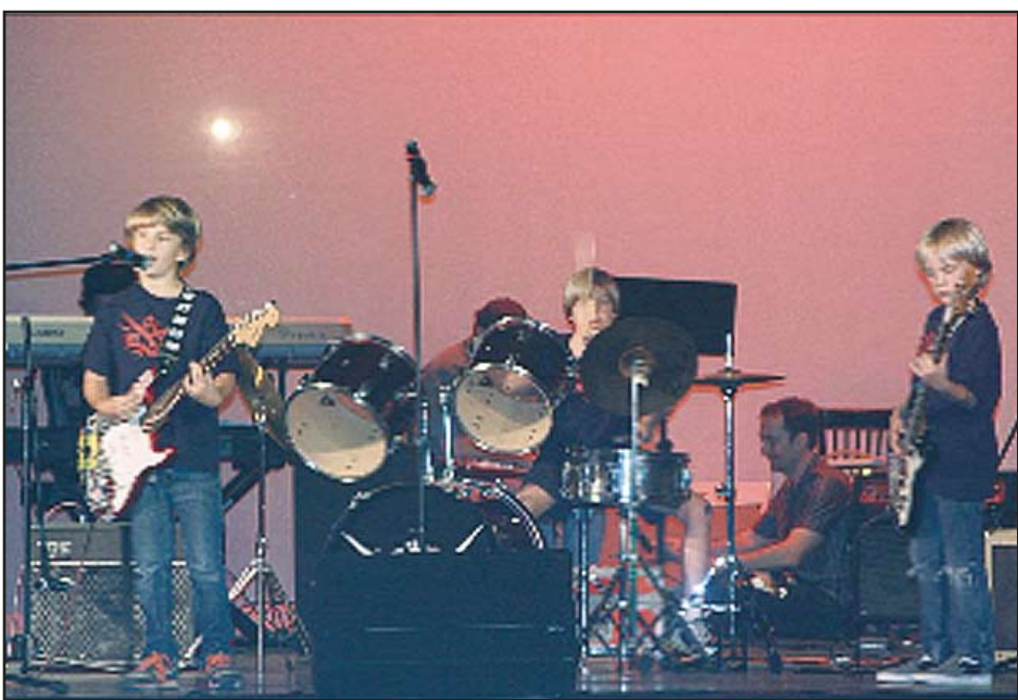
CTC, Rock Band

Please visit their website for information on other programs and services offered at The Frazer Center, www.thefraziercenter.org