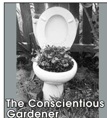
The Conscientious Gardener