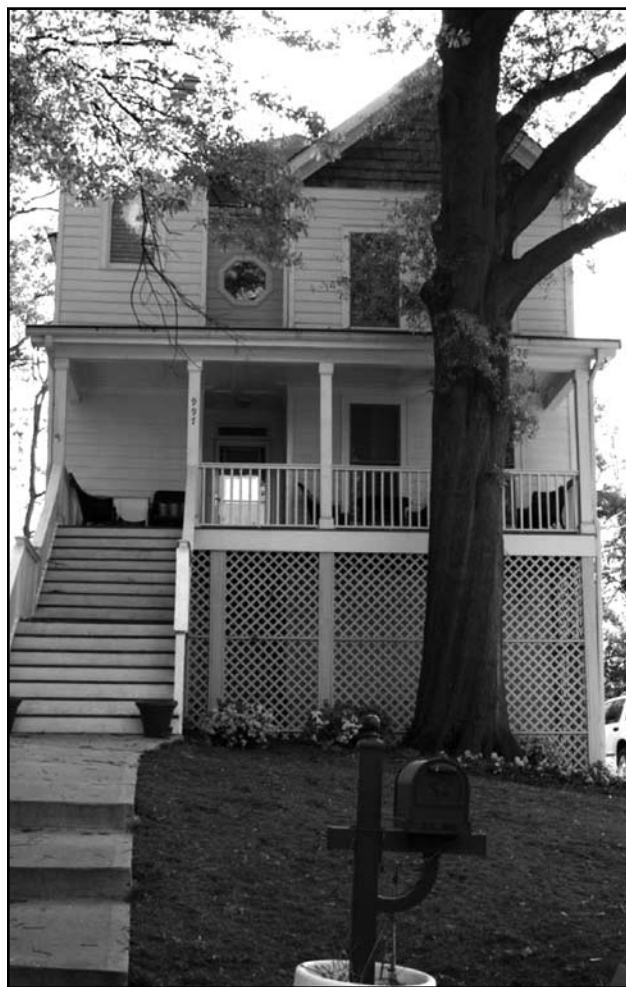
Example of main floor height, which would not be allowed under proposed change to ordinance.

The NPU meeting is Thursday, May 24 at 7 pm at the Little Five Points Community Center, 1083 Austin Avenue.