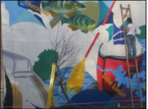
About 75 volunteers, under the direction of muralist David Fichter, accomplished tremendous work over the course of two weeks.