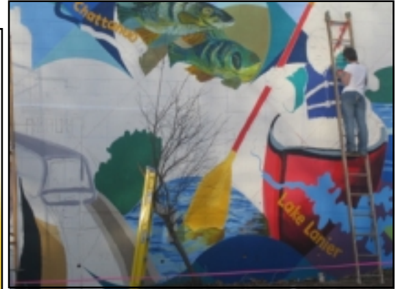
About 75 volunteers, under the direction of muralist David Fichter, accomplished tremendous work over the course of two weeks.